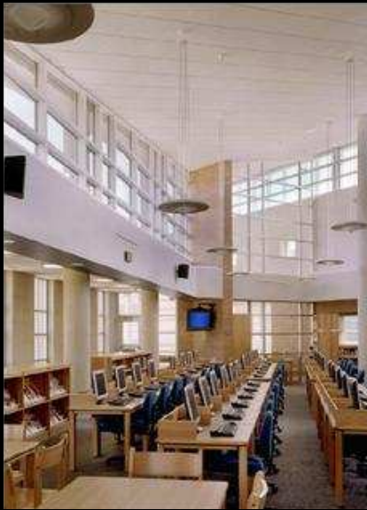
Whitmore Lake High School