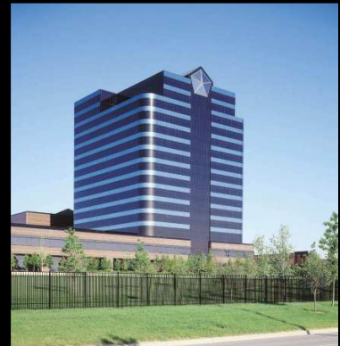
Chrysler Tech Center