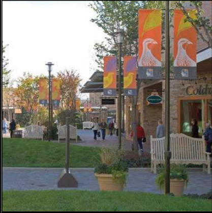
The Mall at Partridge Creek