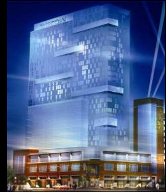
Greek Town Casino

A NATIONAL CONSTRUCTION ENTERPRISES COMPANY