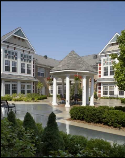
Waltonwood at Main