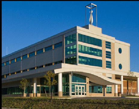
Skyline High School