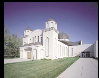
St. George Orthodox Church