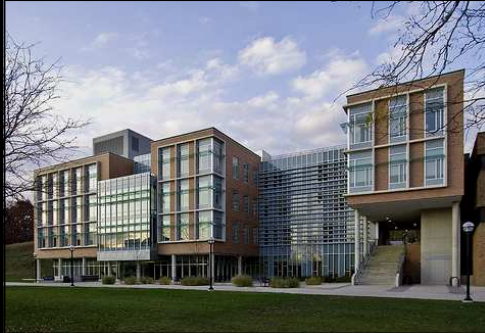
University of Michigan