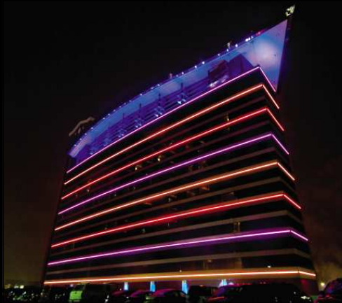
MotorCity Casino Hotel