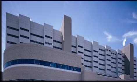
U of M Hospital