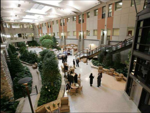
Henry Ford West Bloomfield